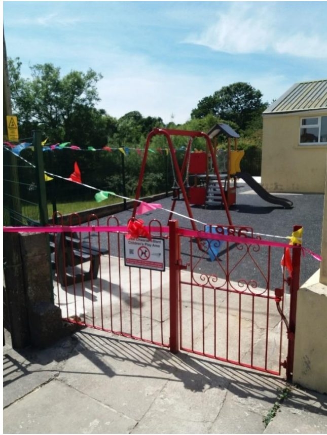
Y Parc Newydd / The New Park