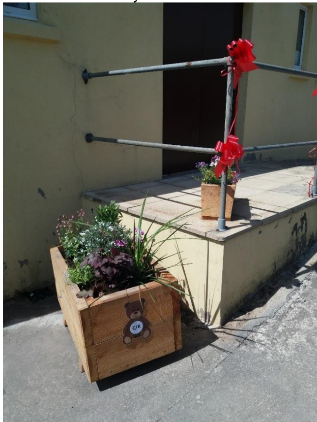
Planwyr Newydd gyda rhan o'r Helfa Eirth Tedi New Planters with part of the Teddy Bear Hunt