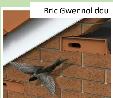
Bric Gwennol ddu