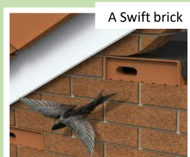
A Swift brick