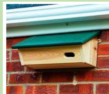
Swift box installed on a house