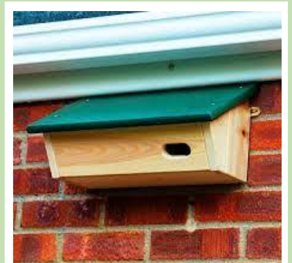
Blwch Gwennol ddu a osodwyd ar dŷ

Allwch chi ledu'r gair yn eich cymunedau fel y gall pobl leol osod blychau gwenoliaid duon hefyd?