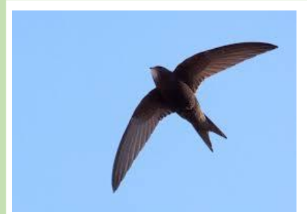
Gwennol ddu (Apus apus)

Cafwyd gostyngiad o 69% yn y niferoedd ers canol yr 1990au